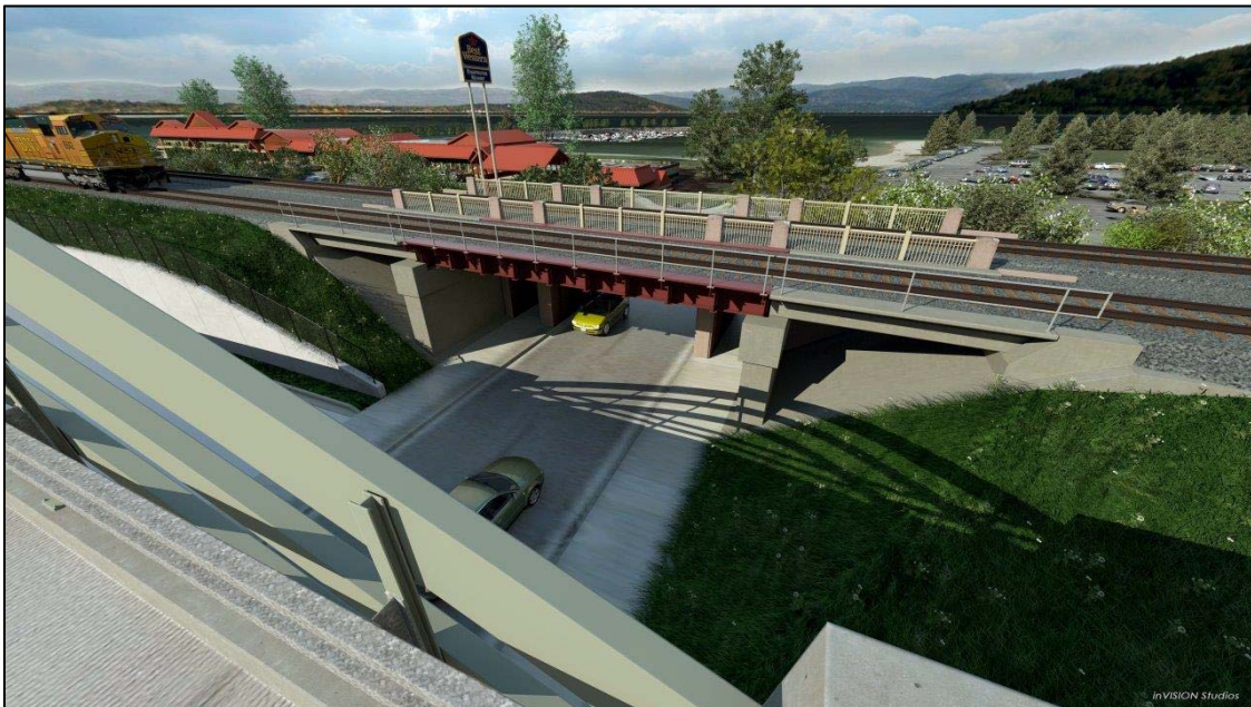
Figure 3. – Concept of proposed BNSF Bridge 3.0, view from Hwy 95 to the East