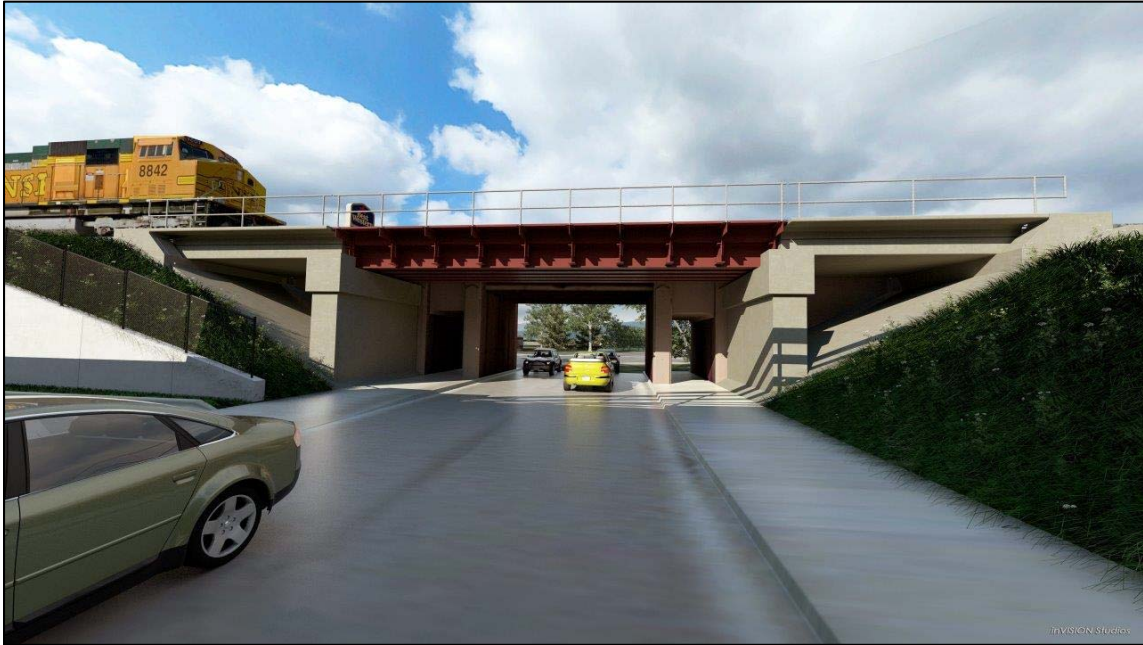
Figure 2. – Concept of proposed BNSF Bridge 3.0, ground view to the East from under the adjacent Hwy 95 bridge

Idaho State Historical Society (SHPO) – RE Section 106 (SHPO#2018-365)