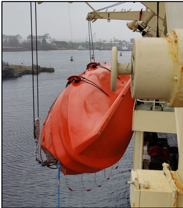
Figure 3 - Lifeboat listing more than 90 degrees w/ crew inside.