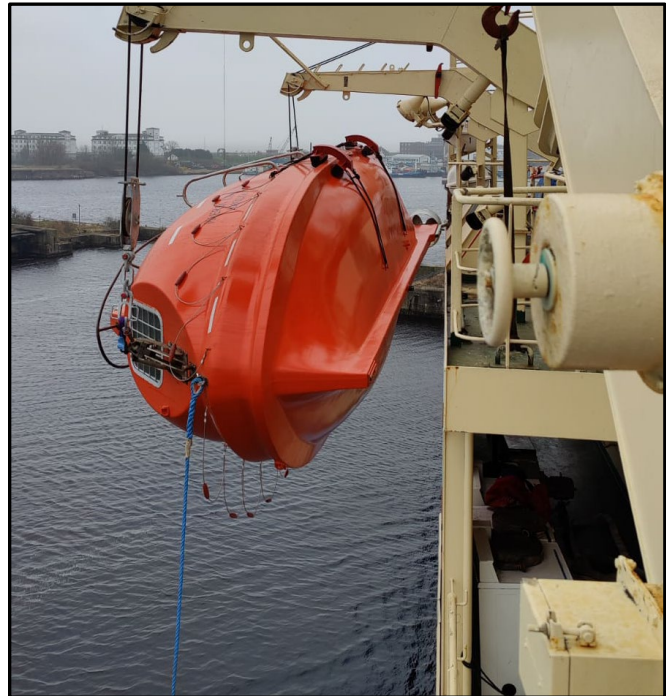
Figure 4 - Lifeboat skeg caught on deck edge.

Marine inspectors, classification society surveyors, and service technicians should be aware of these risks and bring any concerns to the attention of the vessel's crew.