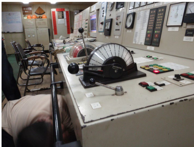
Photo shows Engine Order Telegraph control head.

recommended spare part requirements. Specifically, review preventative maintenance procedures regarding the inspection and/or replacement of critical parts and components within their vessels' Engine Order Telegraph (EOT) control system.