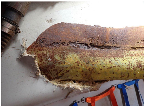
Figure 2: Severely corroded remnants of compressed air cylinder shell. Note the distinct line of deep pitting.

Many lifeboats with these systems store air cylinders horizontally in or just above the bilge area beneath the centerline seats. Although lifeboat canopies are required to be watertight, water ingress/accumulation in the bilges and cylinder storage compartments can be a common occurrence 1 . The lifeboat involved in this incident was designed with a separate compartment to isolate the cylinders from the bilge, but this compartment was also not watertight and had collected several inches of water. Accessing the compressed air cylinders in this lifeboat required the removal of the center divider and seats.