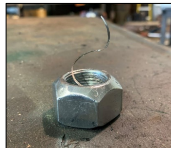
Photographs taken of disassembled ram showing rod stud threads and retaining nut.