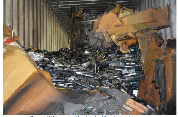
Burnt lithium batteries in fiberboard boxes.

On August 19, 2021, a container illegally loaded with discarded lithium batteries caught fire while enroute to the Port of Virginia. The container was being transported on a chassis from Raleigh, NC, intended for a maritime voyage to a port in China via a foreign-flagged container ship. The batteries caught fire on the highway resulting in loss of the cargo, and significant damage to the shipping container. Upon initial investigation, the responding fire department determined that the heat produced from the fire burned hot enough to create a hole through the metal container's