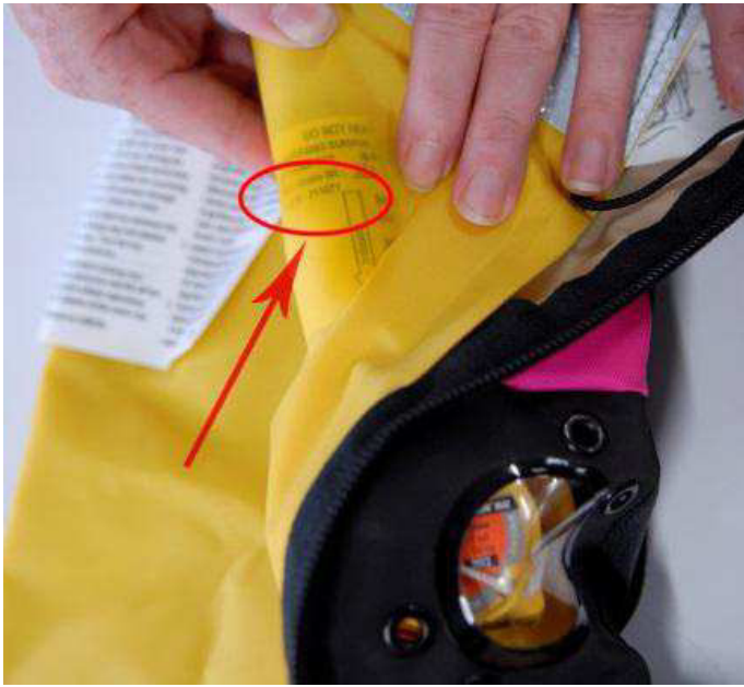
Photograph showing view of lot number through fabric.