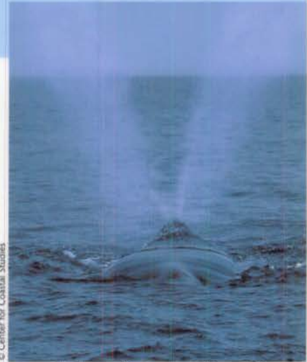
V-shaped blow; no dorsal fin