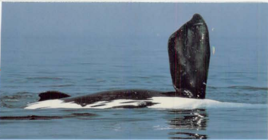
Broad, paddle-shaped flippers