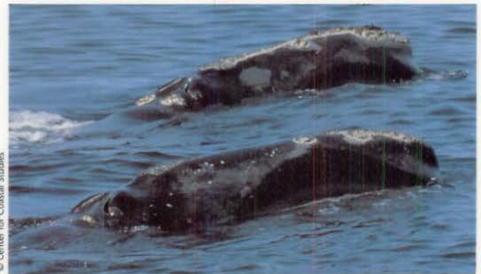
Callosities on their heads