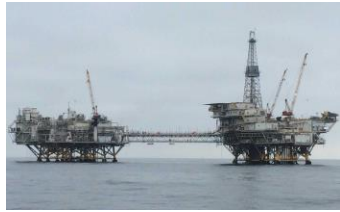
"Bridged" Fixed Platforms