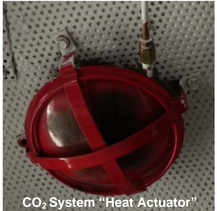
CO 2 System "Heat Actuator"

During two recent vessel inspections Coast Guard Marine Inspectors participated in and witnessed occasions where the testing and maintenance of a CO 2 system resulted in serious safety threats that could have easily led to loss of lives. The incidents included an accidental release in the space where a sensor was being tested that nearly resulted in a fatality and another situation where CO 2 came close to being released without warning into an occupied engine room space after errors were made during routine system maintenance. CO 2 fire extinguishing systems present an inherent risk to the personnel involved with their inspection, testing, and maintenance. Over the years the Coast Guard has become aware of multiple events where these systems have inadvertently released or leaked and caused the deaths of shipboard personnel, technicians and inspection personnel. CO 2 system inspection, testing, and maintenance require thoughtful planning and risk mitigation efforts to prevent such events from happening.